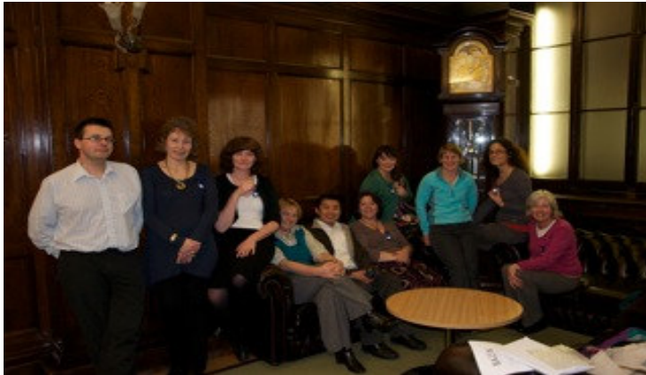
Southern Region Committee at Link members' evening March 2010.

The nominations for the Committee for 2010- 2012 are as follows: